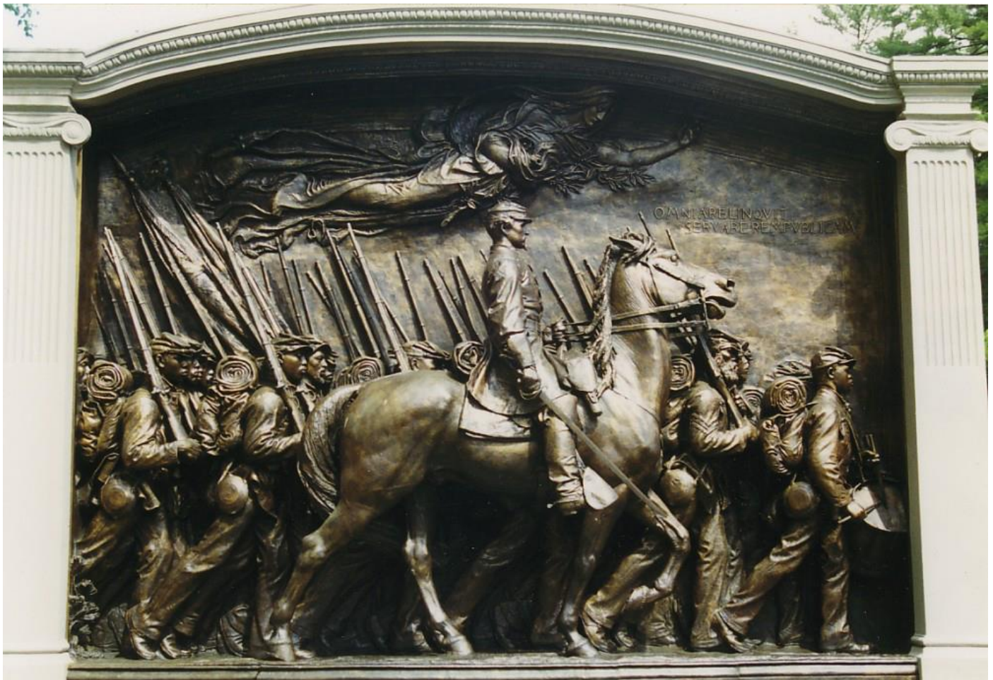
Bronze memorial to Shaw and the 54th regiment , by sculptor Augustus Saint-Gaudens , Boston Common (1884–1897) Used in the ending credits scene of the 1989 film, Glory .

(Portions from britannica.com and Wikipedia)