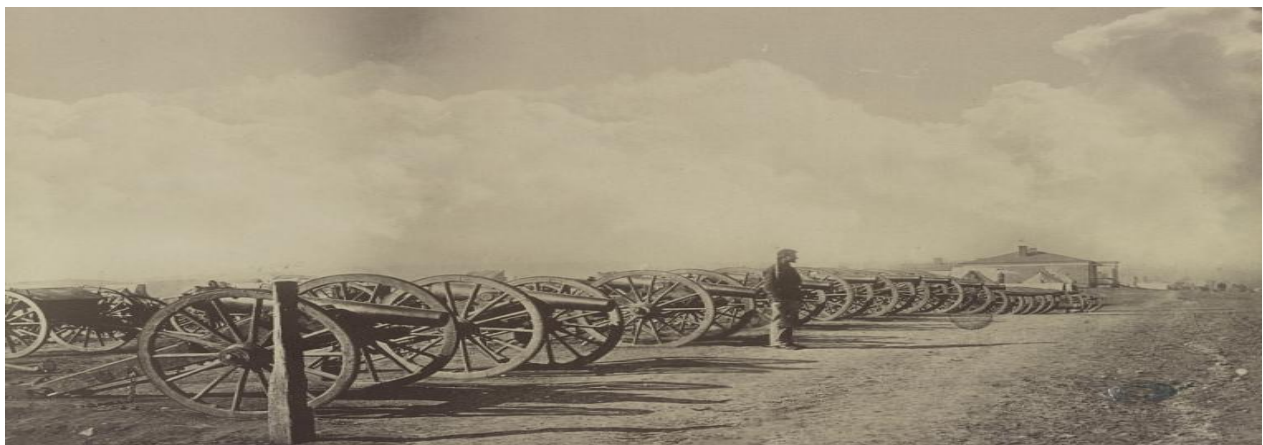
Captured Confederate Artillery from Missionary Ridge