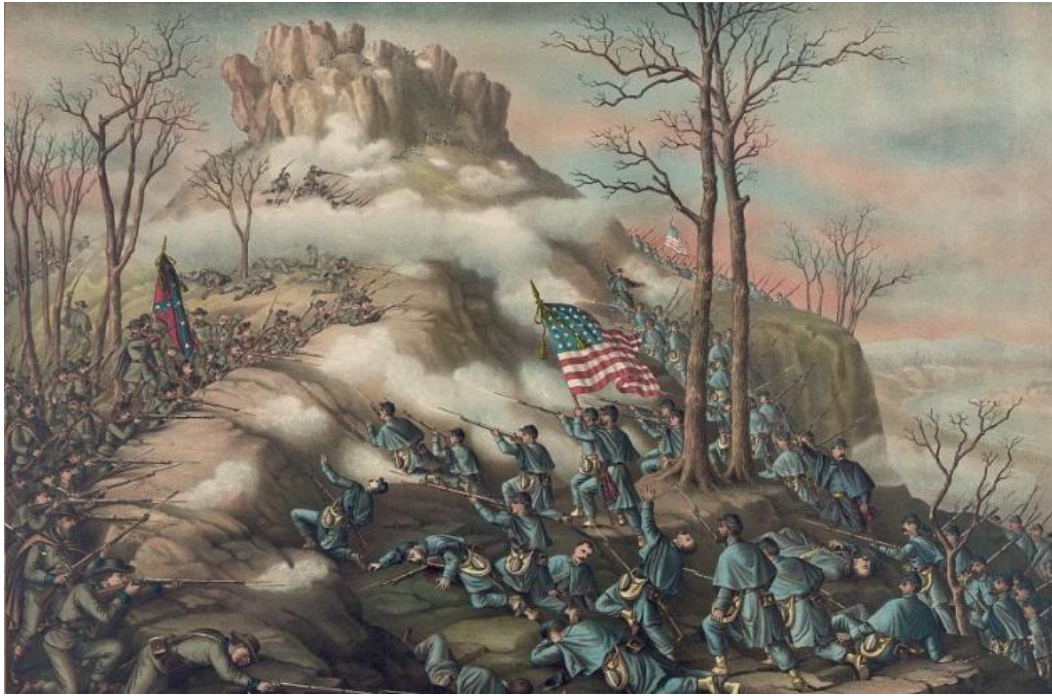
The Battle of Lookout Mountain, sometime referred to as the Battle Above the Clouds