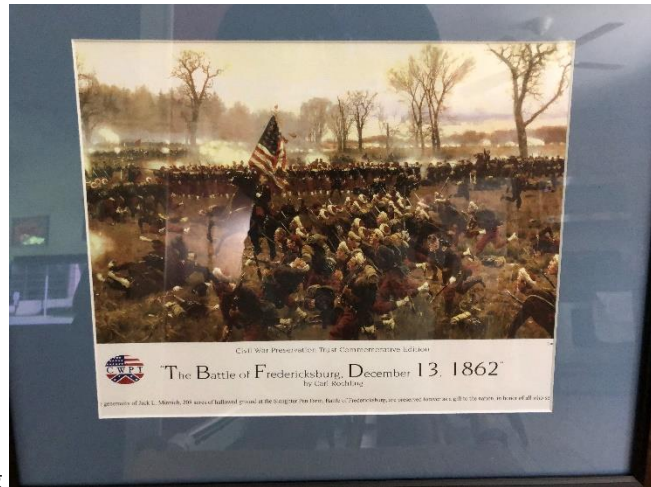
11. Print of The Battle of Fredericksburg