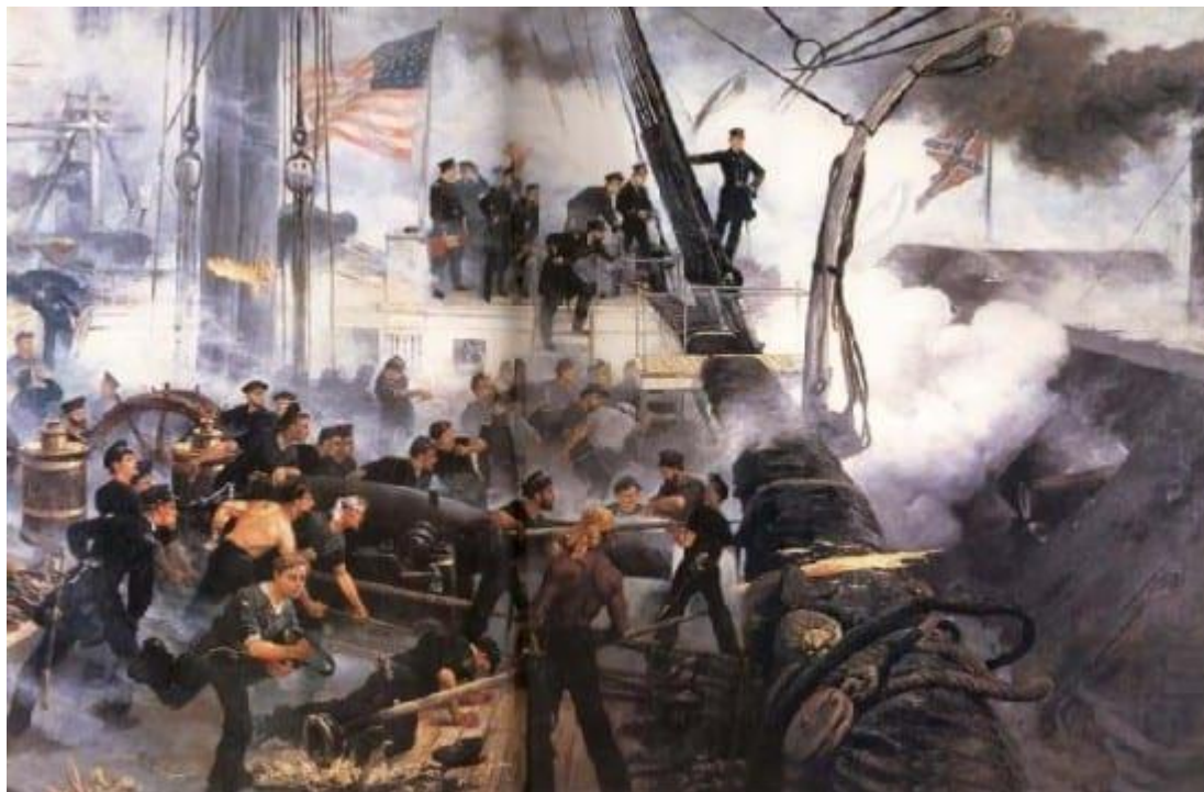
Battle of Mobile Bay

As a lover of history, you know how critical it is to keep history alive, especially today! We very much appreciate your continued support for the GAR Civil War Museum.