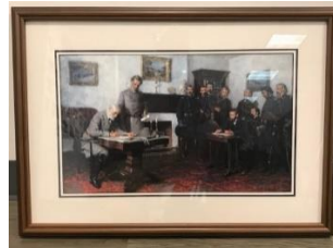
1. Appomattox Surrender Signing Print