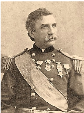
Exhibit Opens September 24, 2022

J. F. Hartranft and the Schwenkfelder Experience in the Civil War Schwenkfelder Library & Heritage Center, 105 Seminary Street, Pennsburg, Pa. 18073