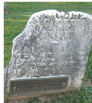
One of several battle-damaged graveyard markers at the Evergreen Cemetery.

Interested? Contact Claire at clkuk@ptd.net