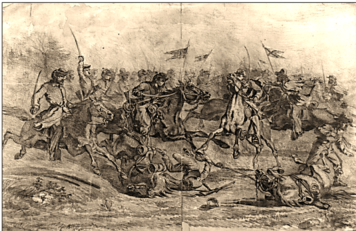
June 9, 1863: Calvary Charge - Battle at Brandy Station

Artist: Edwin Forbes