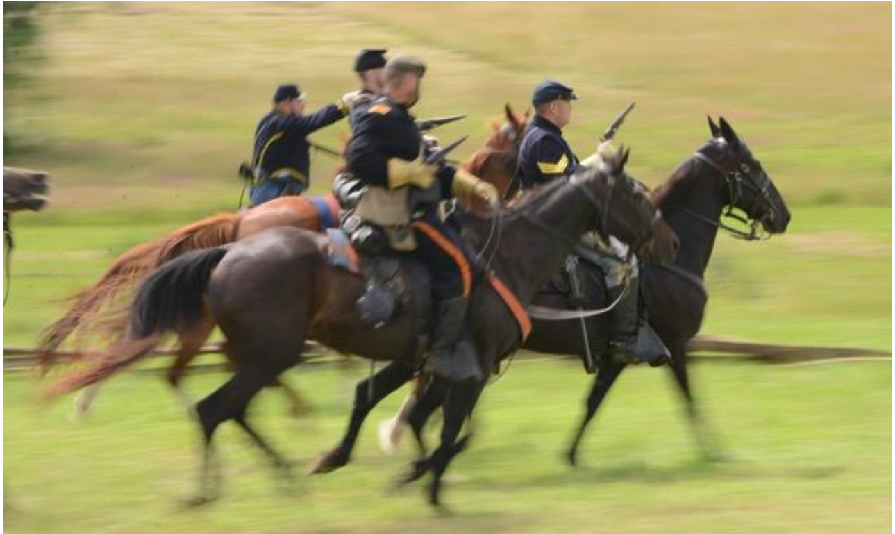
The Calvary with Pistols Blazing