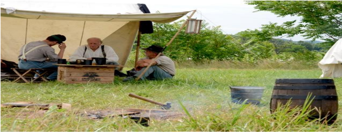
Taking a Well Deserved Break at Civil War Reenactment