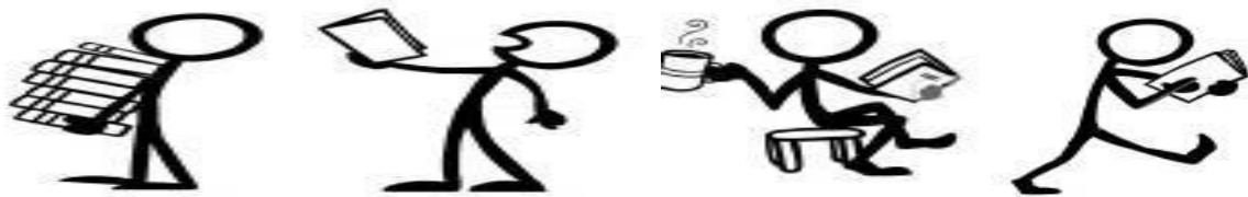
Book Raffle Winners for September 2016