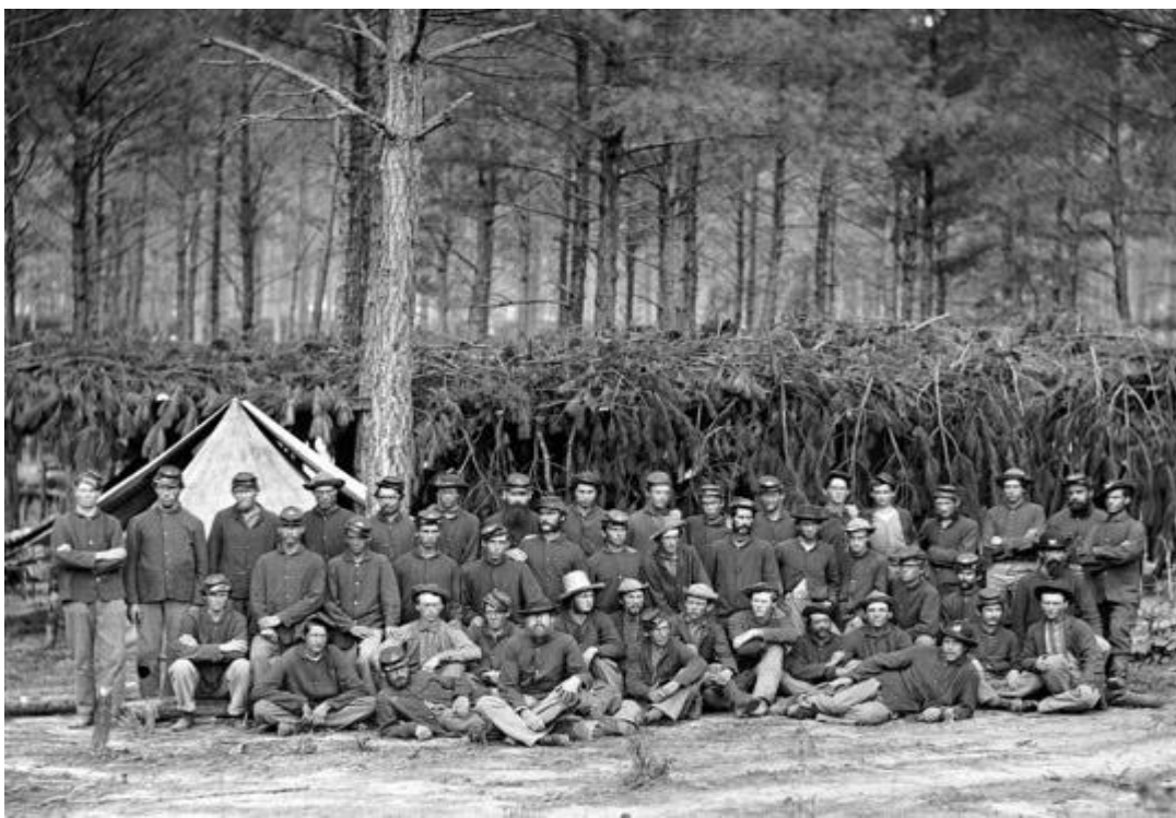
[Petersburg, Va. Company A, U.S. Engineer Battalion]. Created-Published: August 1864. Photograph from the main eastern theater of war, the siege of Petersburg, June 1864-April 1865.

hard marching and superb logistical work, the Federals began crossing the James River. Once across the river Grant set his sights on the vital transportation hub of Petersburg. Defended by roughly 4,600 Confederate troops under the Command of General P.G.T. Beauregard, could Petersburg hold out until reinforcements arrived from General Robert E. Lee who was in the dark about the whereabouts of Grant's army.