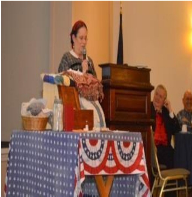
More pictures of our members enjoying themselves at the December meeting