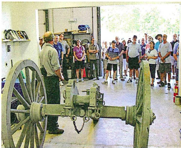
FIRST CORPS MEMBERS ENJOY THE PROGRAM AT THE CANNON SHOP