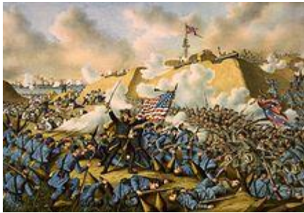
Capture of Fort Fisher. Troops led by Union Army Major General Alfred H. Terry fighting Confederates

After Butler's removal, he was replaced by Major General Alfred Terry , and the operation was dubbed "Terry's expedition." Admiral Porter was again in charge of the naval attack. They waited until January 12, 1865, for the second attempt.