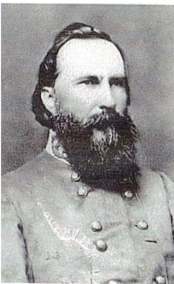
General James Longstreet