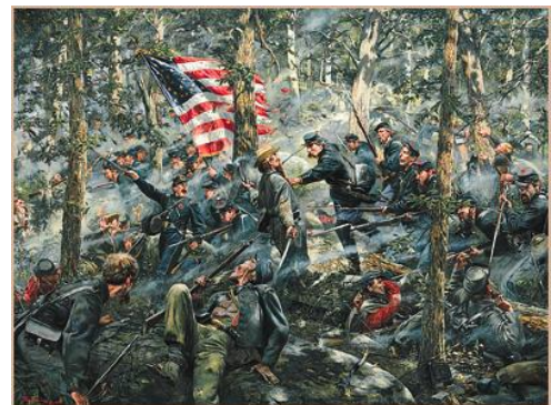
July 2, 1863 Col. Joshua Chamberlain led his men of the 20th Maine regiment in a gallant attack, to hold back the advance of the Alabamians, on Little Round Top at Gettysburg

great prizes can be yours at the June meeting. Thanks to all of you who helped make the December Preservation raffle a success!