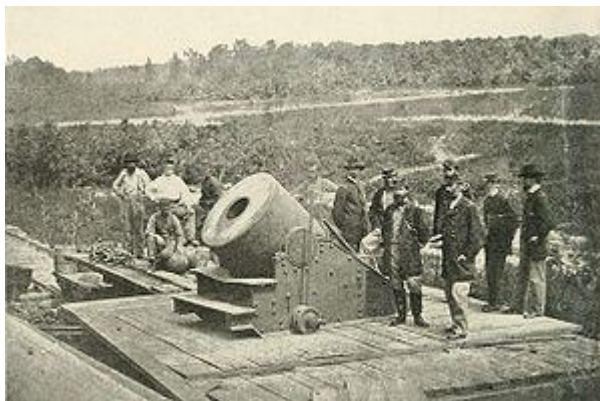
The "Dictator" siege mortar at Petersburg.

Confederate Generalship During the Petersburg Campaign