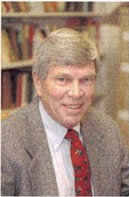
Prof. James M. McPherson

We welcome to our round table this month the world-renowned historian of the American Civil War, Dr. James M. McPherson. Dr. McPherson is the George Henry David Professor Emeritus of United States History at Princeton University. Born in Valley City, North Dakota, he received his Bachelor of Arts (magna cum laude) from Gustavus Adolphus College in St. Peter, Minnesota and his Ph.D. from Johns Hopkins University. He has authored a host of books on the Civil War and Abraham Lincoln along with countless articles for Civil War and historical publications. Many of his books are award-winning works, which include For Cause and