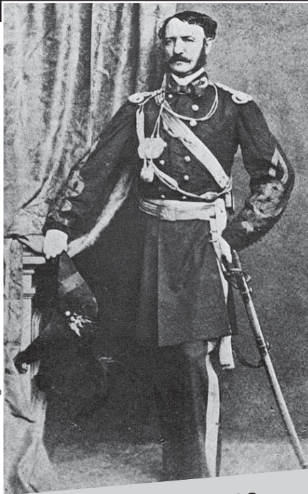
The Image of War