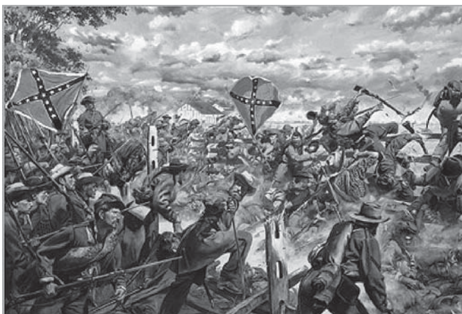
On July 3, 1863, Maj. Gen. Isaac Trimble's brigade, Gen. Pettigrew's division, crossing Emmitsburg Road during Pickett's charge at the battle of Gettysburg.