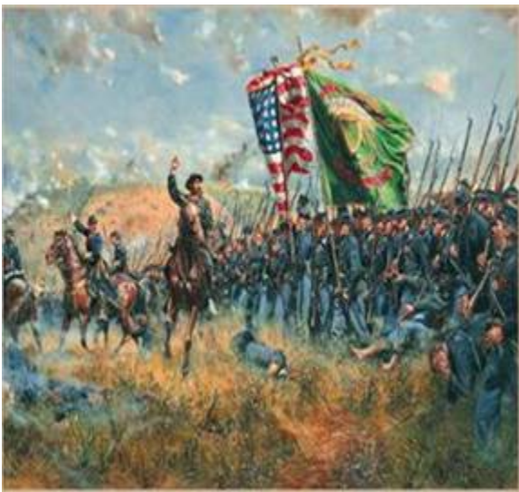
Sons of Erin by Don Troiani

September 17, 1862. It was just 10:30 a.m. and the battle that was raging around the village of