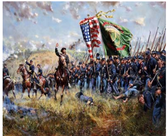
September 17th 1862, Sharpsburg, Maryland. Father Corby gives absolution in front of the 69th New York Regiment.

In addition to this fine print, you will also have a chance to win one of the following GREAT prizes! Second place, a four volume set of Battles and Leaders of the Civil War ; Third place is a commemorative medallion about the Battle of Gettysburg, from a limited set of 5000, from the CW Library and Museum; Fourth place is a DVD regarding "Fredericksburg, Then and Now", with a companion soft cover book, from CVBT. Fifth place is a three disc VCR set, "Guns of the Civil War", with 1 VCR regarding Civil War combat.